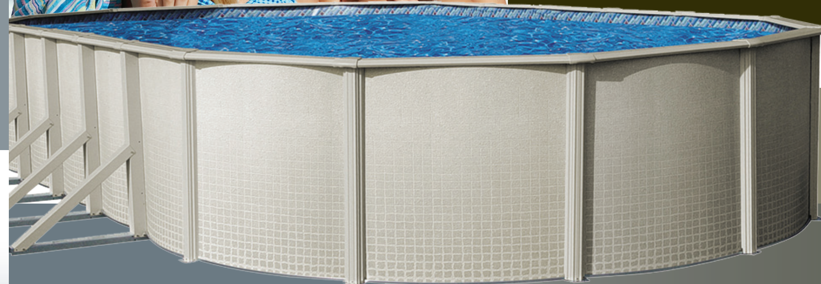
Impression Wall Pattern