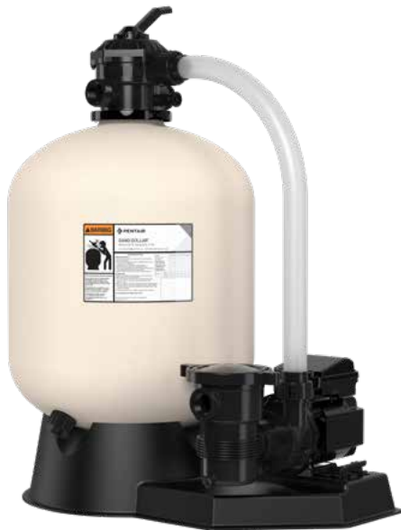
SAND DOLLAR SAND FILTER SYSTEM