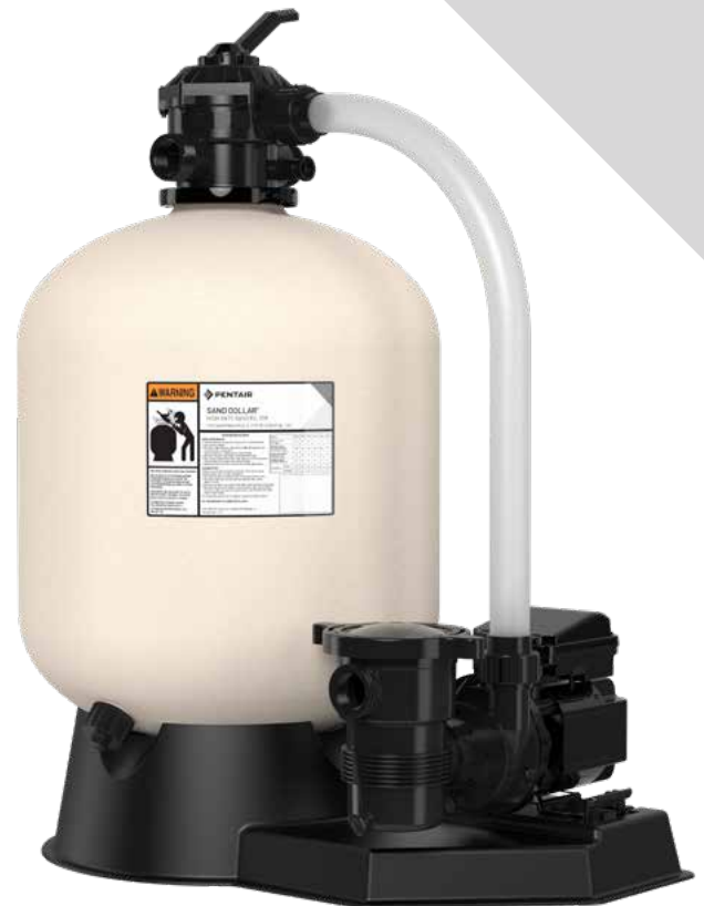
▲ SAND DOLLAR SAND FILTER SYSTEM